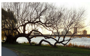
Charles River, Boston

We were both nervous about presenting, but the environment in our sessions felt encouraging and supportive. Presenting on Sunday afternoon/ evening resulted in smaller numbers of people in the audience, but it was great to have the opportunity to share our research with people with similar interests. In order to calm our nerves, our strategy was to distract ourselves before the presentation by doing a 'Duck Tour of Boston' and to reward ourselves after each of our presentations by going to the Cheesecake Factory for some dessert where we could choose from a selection of over 50 cheesecakes!