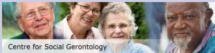
Centre for Social Gerontology